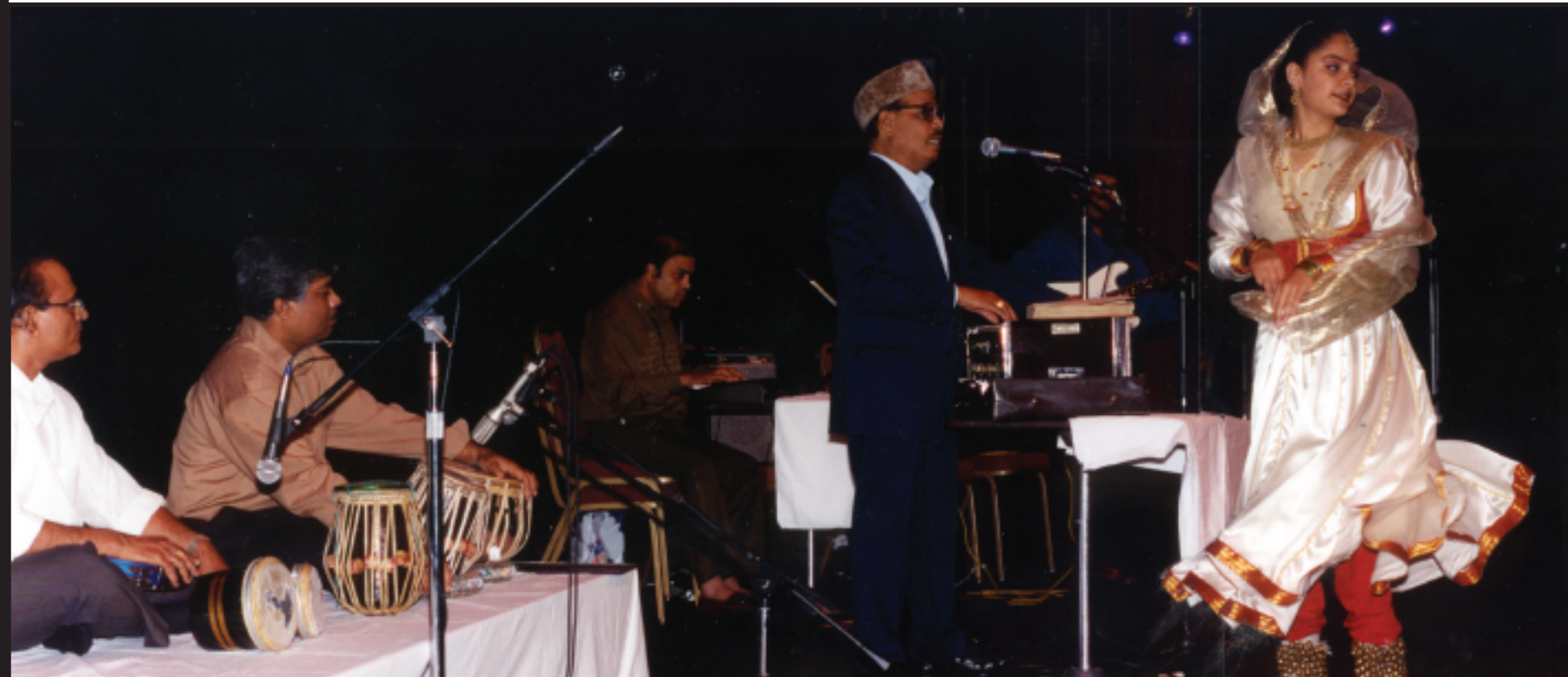
Flashback: Manna Dey in performance at the Queens Theatre in the Park 1995

songs, by sheer power of the Manna Dey rendering. In Indian films Manna Dey is known to be the voice of character actors. In Kasmee Wade Pyar Wafa (Upkar) for instance he brought out the pleas of the forgotten one so well that it touched the cone of audience heart. Subsequently, he became the most sought after Indian film playback singer virtually singing in all Indian languages.